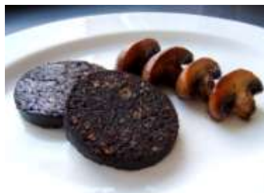
Picture 16 – Black pudding

Black pudding. Whilst at first glance, this may look like chocolate, black pudding (sometimes referred to as blood pudding or blood sausage) is made from pigs blood and fat – another Scottish favourite (picture 16.)