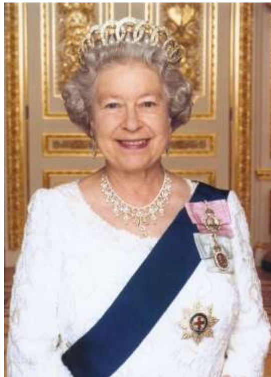
Picture13 – Queen Elizabeth II

Parliament is the most important authority in Britain. The monarch serves formally as a head of state. The power is hereditary, not elective. The Queen or King reigns but does not rule. The present Sovereign is Queen Elizabeth II (picture 13). She was crowned in Westminster Abbey in 1952. The Queen's residence in London is Buckingham Palace.