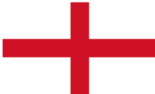
Picture 3 – St. George's Cross

The flag of England is represented by a red cross on a white background. This is known as St. George's Cross and has its origins in the Crusades (12 th and 13 th centuries), when soldiers were identified by this red-coloured cross on their white tunics. St. George was claimed to be the Patron Saint of England at the time, so the cross became associated with him (picture 3).