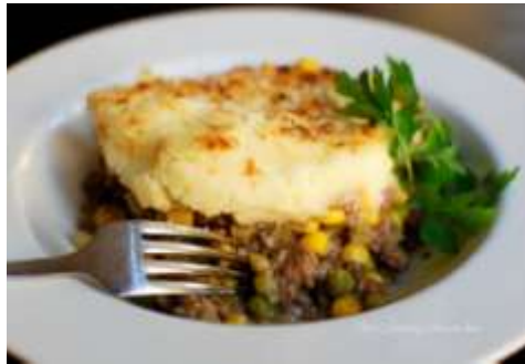
Picture17 – Shepherd's pie or Cottage pie

Shepherd's pie or Cottage pie. Neither Shepherd's pie or Cottage pie are "pies" in the traditional sense (pastries with a lid). They are essentially identical dishes: minced meat cooked with vegetables and topped with mashed potato. The difference lies in the meat that is used; minced lamb in the shepherd's pie, and minced beef in a cottage pie (picture 17)