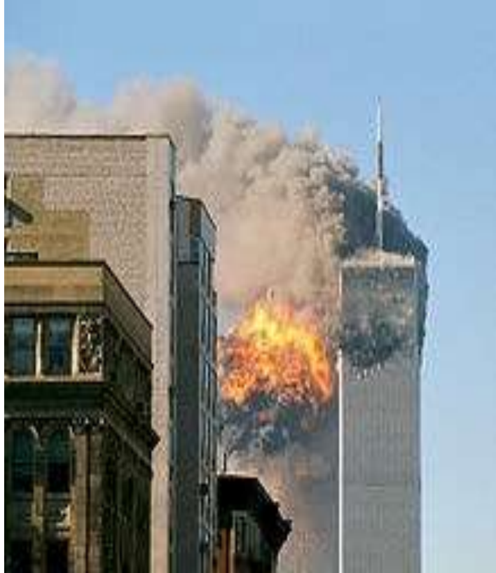
Picture 21 – Terrorists’ attack of the World Trade Center in New York City