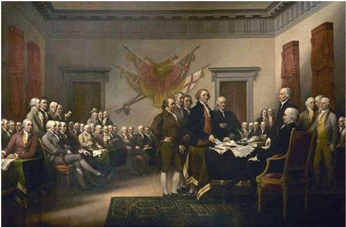
Picture 18 – Adoption of the Declaration of Independence by the Congress

After the British defeat by American forces assisted by the French and Spanish, Great Britain recognized the independence of the United States and the states' sovereignty over American territory west to the Mississippi River. Those wishing to establish a strong federal government with powers of taxation organized a constitutional convention in 1787. The United States Constitution was ratified in 1788, and the new republic's first Senate, House of Representatives, and president – George Washington –took office in 1789. The Bill of Rights, forbidding federal restriction of personal freedoms and guaranteeing a range of legal protections, was adopted in 1791.